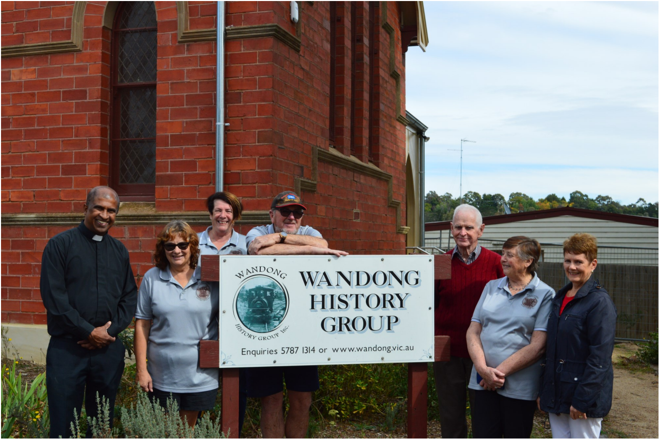
Members of the History group and St Patricks Parish pleased the project is nearly complete