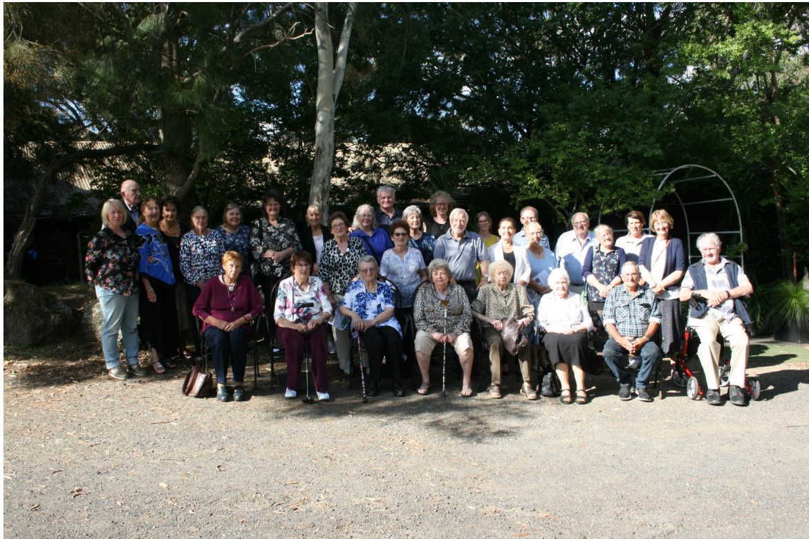
Back to Wandong Lunch participants