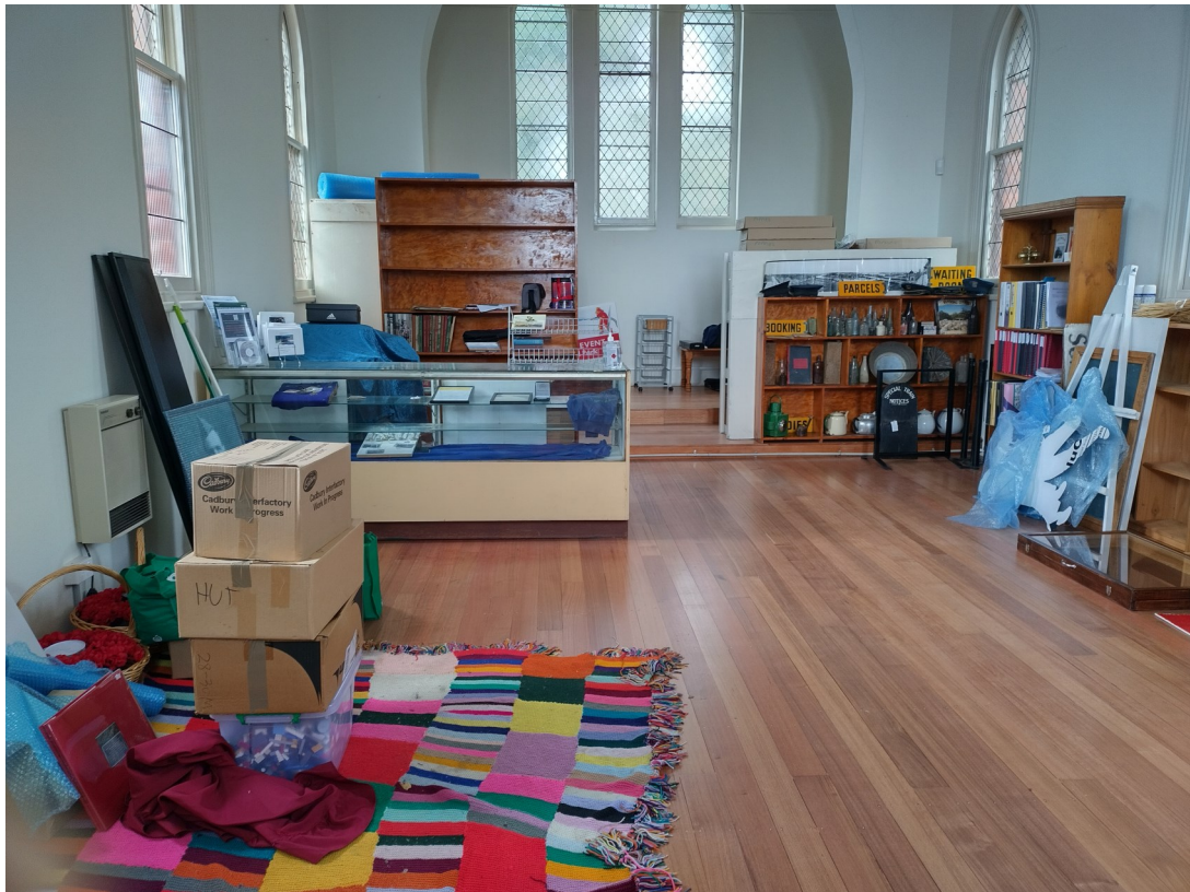
A new beginning for the Wandong History Group, we cant wait to be settled in and organised.