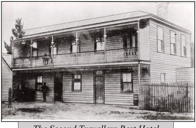
The Second Travellers Rest Hotel

(This poem is quite long to find a full rendition go to the publication - Ghosts Gold and a White Elephant Ron Pickett)