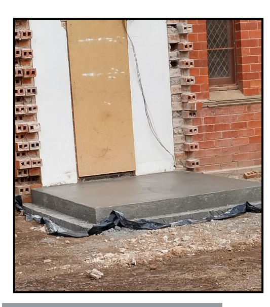
5. New sacristy floor laid.