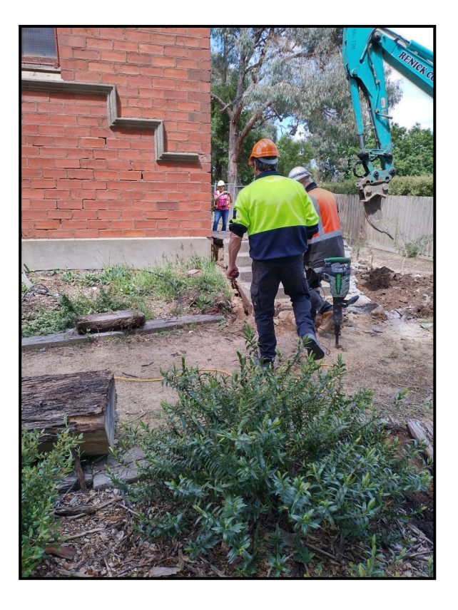
10. Overseeing the works, archaeologists and builder.