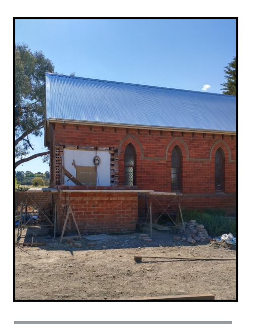
6. Rebuilding the sacristy.