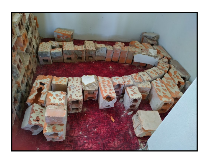
3. Bricks laid out in order as they were removed from the sacristy.