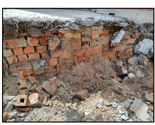
4. Bricks uncovered under porch landing.