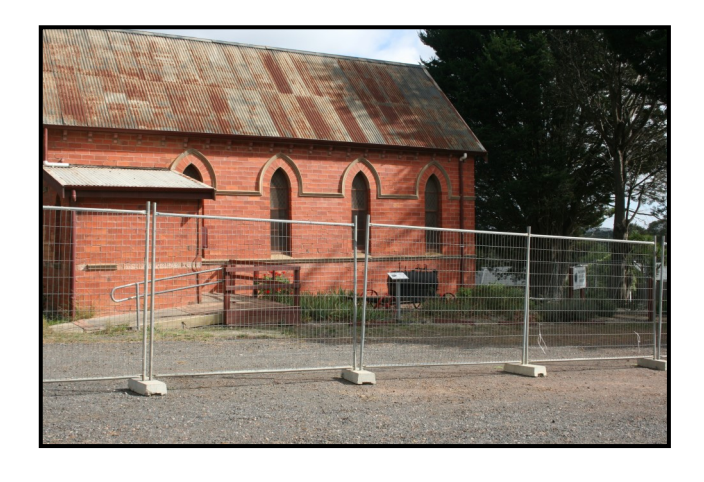
1. Prior to work starting.