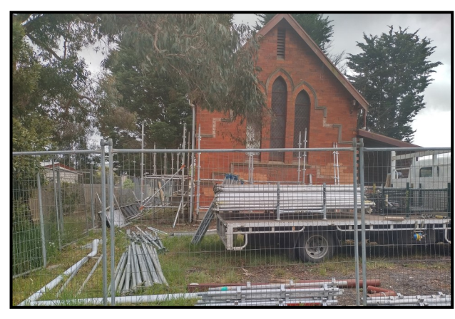
2 . Scaffolding ready to be erected.