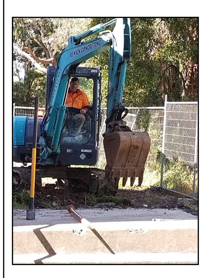
9. Preparing area for new access ramp.