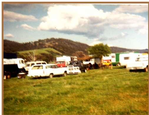
Taking a break in filming.