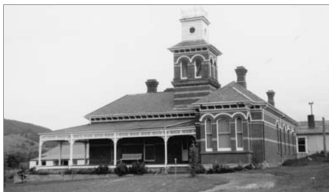
CLONBINANE PARK HOMESTEAD