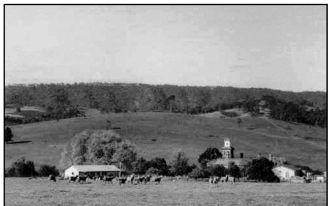
Images of Clonbinane Park in all her glory