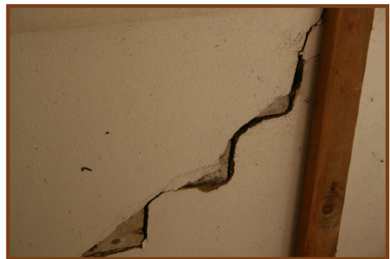
Image below shows some of the internal damage that will be repaired.

Since then the group has worked to secure a Living Heritage Grant to restore the building and in 2020 this application was successful. Once the Heritage Permit is provided we are ready to begin restoration of the building. It will be great to be able to set up properly and have an all access building which will mean we can open to the public and have permanent displays as well as helping people with research.