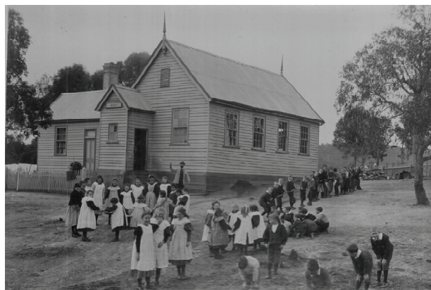
Wandong State School 1890's

Ensure that all residents realise how lucky they are to live here and that they look after their town. Rubbish, vandalism, there is a lack of community involvement – it needs to be kept in check. We also need to educate the young people of our town about these things. It's not until you travel overseas you really realise what a beautiful place Wandong/Heathcote Junction is and we need to maintain this beauty as we grow.